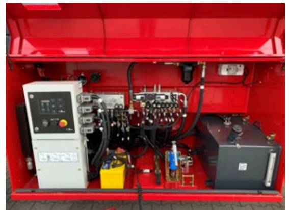
On-board diagnostic system