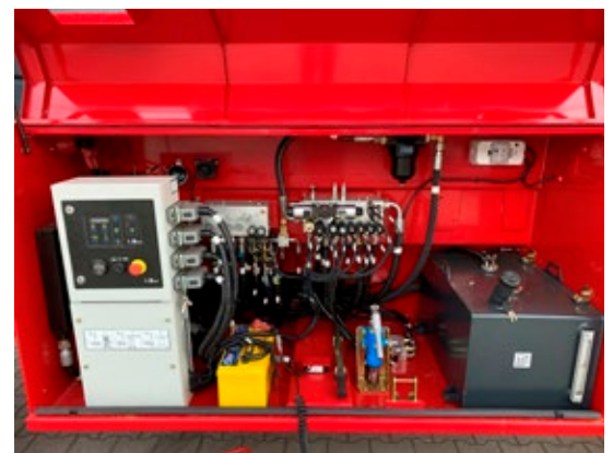
On-board diagnostic system